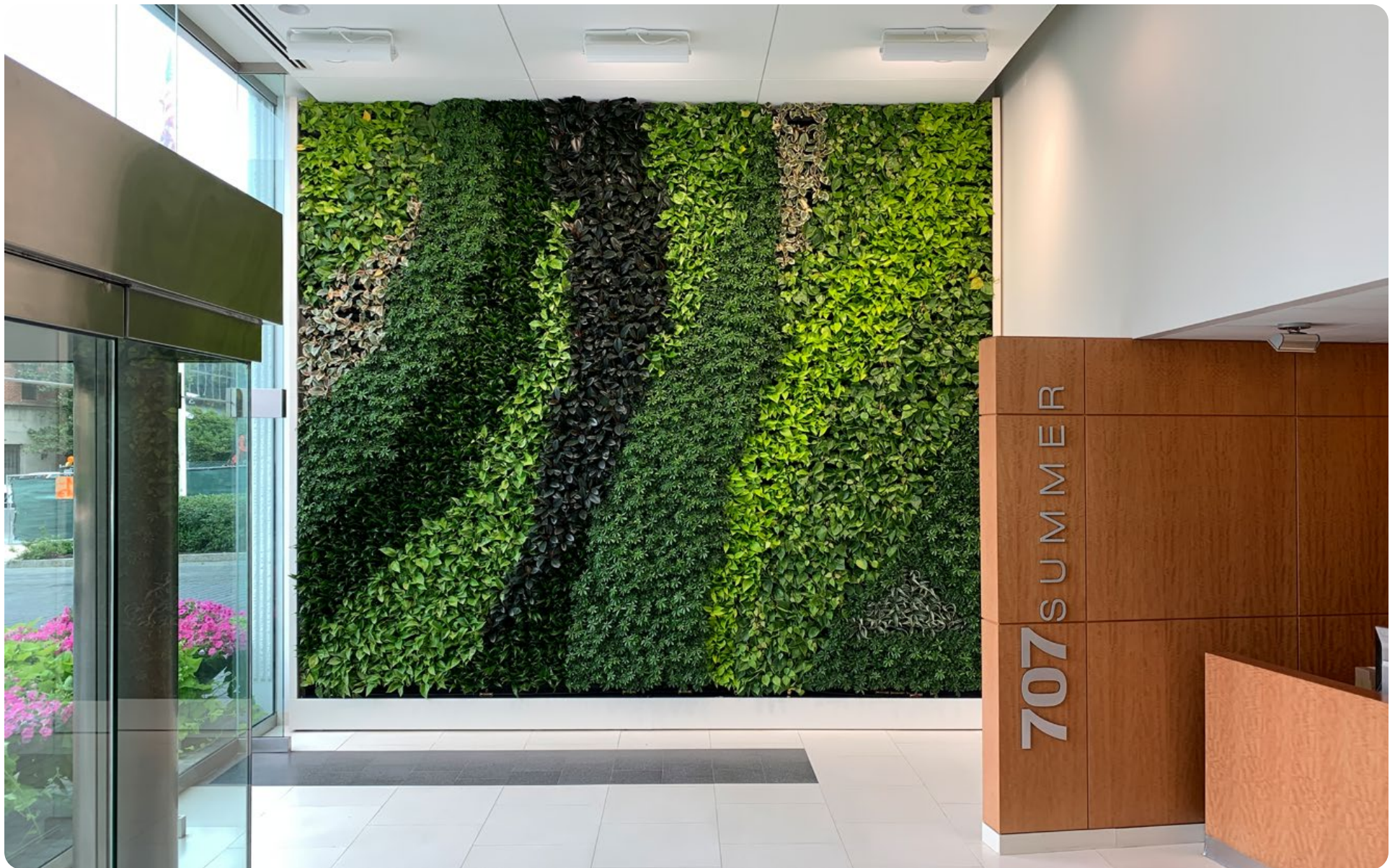
MAIN LOBBY WITH LIVING WALL